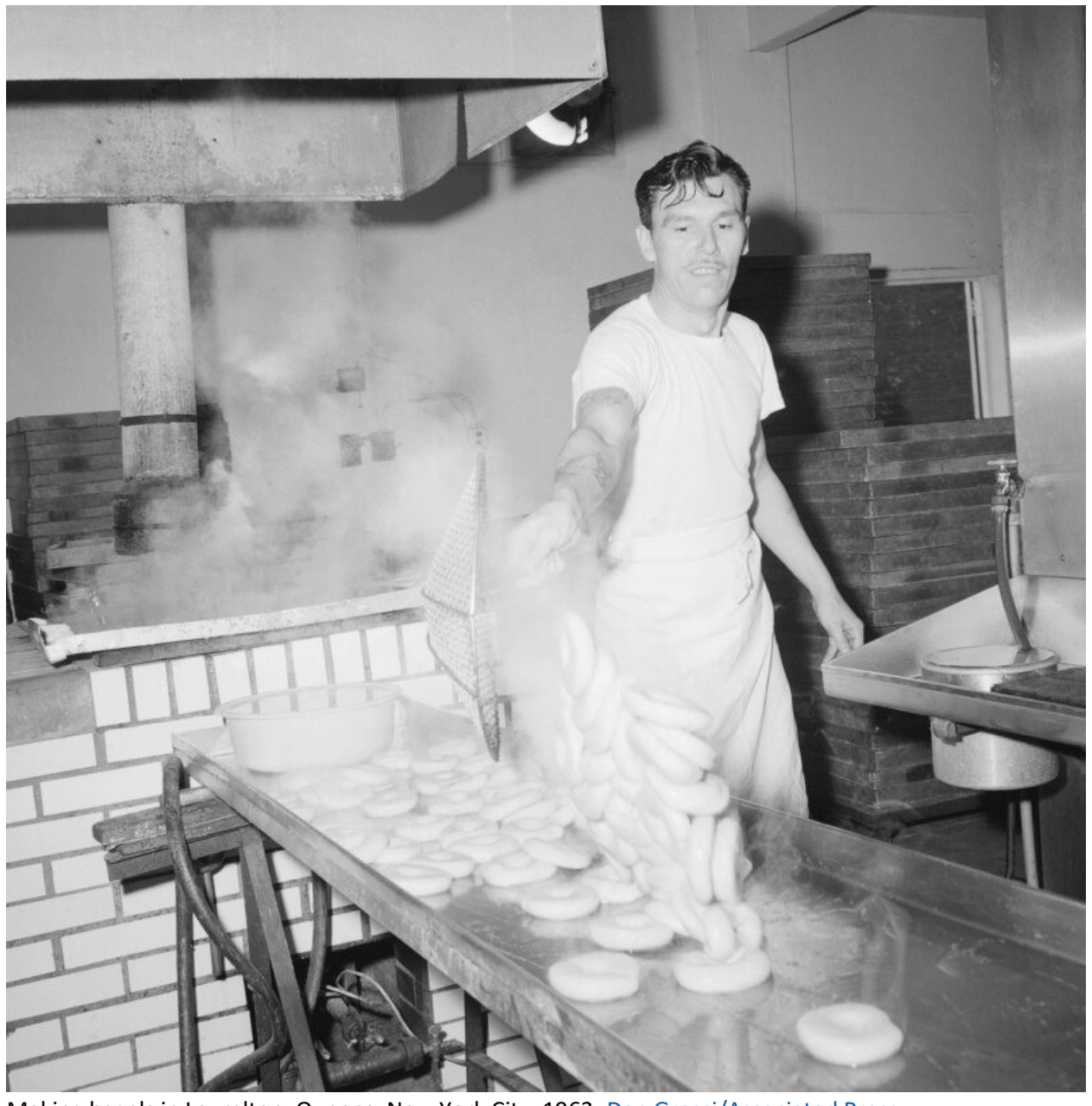
Making bagels in Laurelton, Queens, New York City, 1963.

Each day, bagel bakers were manufacturing 250,000 bagels. According to the Times in 1960, the union had stamped out any attempt to automate the process—a "mad attempt by some radical" to can them, and a "pretzel machine manufacturer who offered to make bagels without the human touch." The traditional dough was simply too tough for a machine to wrangle, leaving the bakers' bargaining position undisturbed. With near-unlimited control over the bagel market, they struck for 29 days in 1962, resisting state attempts at mediation and reducing the city's bagel supply by 85 percent. Eventually, employers acquiesced to all their workers' demands.