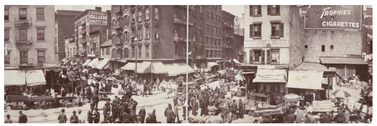
New York's Lower East Side, where bagels became ubiquitous.

The men of Bagel Bakers Local 338 were not to be trifled with. Founded in the 1930s, all 300-odd initial members were Yiddish speakers who descended from these hardy early bakers. Joining required a family connection—though this wasn't sufficient on its own. Only after three to six months of apprenticeship, once a "bench man" had attained a minimum rolling speed of 832 bagels an hour, could members' sons and nephews be grudgingly brought into the fold and given labor cards.