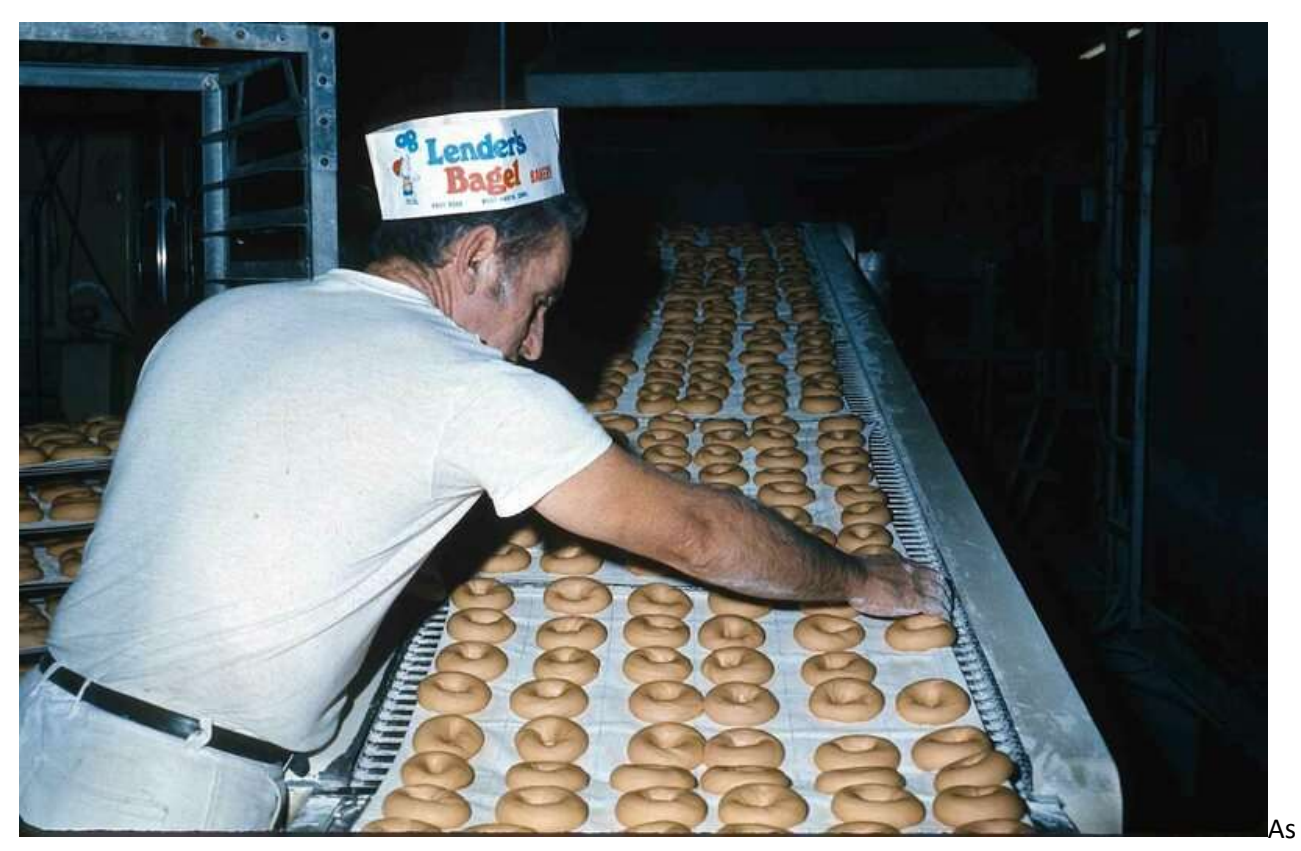
technology improved, machines were developed that could make bagels faster, and more cheaply, than traditional artisanal labor. <u> </u>