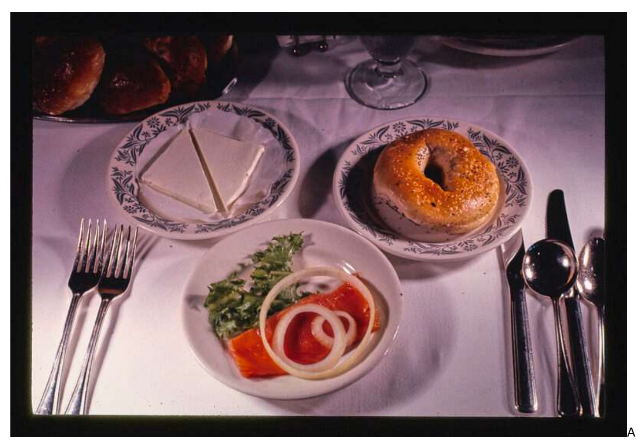
bagel served with lox and cream cheese at Kutsher's restaurant in New York, 1977.

Remembering Local 338 and the world's toughest bagel bakers. by Natasha Frost February 9, 2018